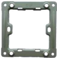
Steel structure base