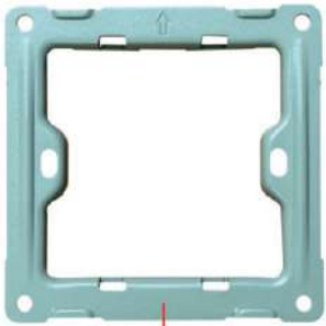
Steel structure base