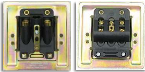
BASE Steel Structure